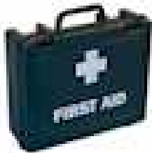
Vehicle First Aid Kits

A COMPREHENSIVE RANGE FO TRAVEL KITS AND MEDICAL PACKS TO SUIT YOUR TRAVEL REQUIREMENTS.