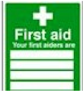
First Aid Signs